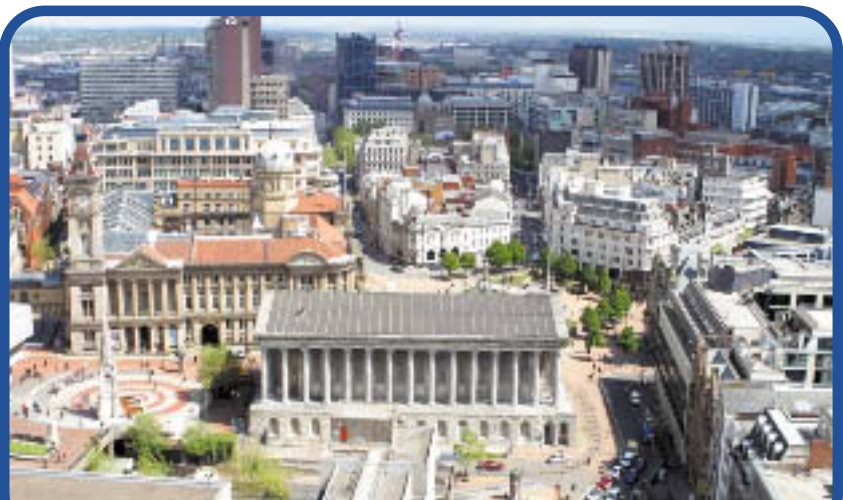
City of the Future: Birmingham will become the first ethnic majority city in 2010

Sir Digby Jones, CBI director-general and a former Birmingham lawyer, also called continued on page 2